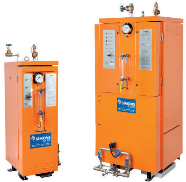
VS 300 SERIES 10 TO 80 KILOWATTS