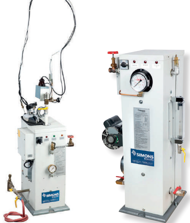
SB 2S SERIES 3.6 TO 10 KILOWATTS